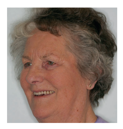
Fig. 7 Complete denture set up of generalised teeth arrangement (British Standard Denture) with no reference to the patient's natural dentition

become 'dental obsessives'. When they walk into a room full of new people, it is their mouths not their eyes that they first focus on. And a smaller but increasing proportion of denture wearers hate the monochrome pink and unnatural contours of their conventional artificial gums. Our patients' aesthetic expectations seem to be rising. It is here that we hit a snag.