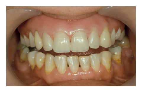
Fig. 2 The same policewoman, less phobic, after scaling, oral hygiene instruction, closing the gaps between the lower front teeth with composite additions and a new upper complete denture. No local anaesthetics were needed. On completion of treatment she said, 'God, don't take me now!'

provide proper lip support and look attractive to the wearers and their circle of family and friends. Helping denture sufferers regain their lost or diminished social confidence, their self-esteem, natural beauty, and overall morale provides some of the greatest, most positive work experiences open to the clinical and technical members of the dental team (Figs 1 and 2).