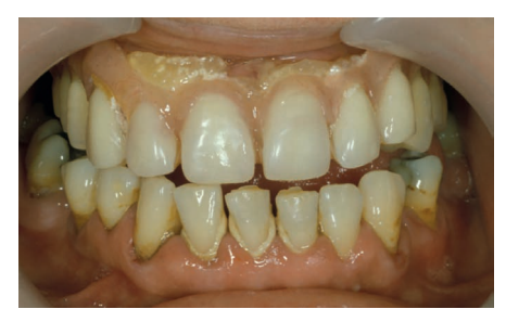
Fig. 1 Dentally phobic policewoman finally seeking dental help after years of avoidance