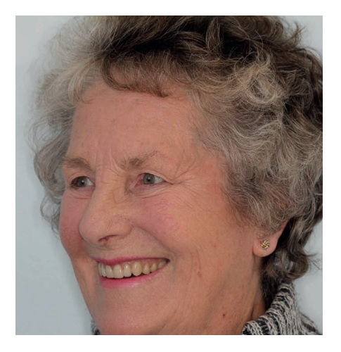
Fig. 9 The patient with maxillary complete denture mimicking the natural dentition shown in Fig. 8

a feature of these dentures, as required by their speed of construction.