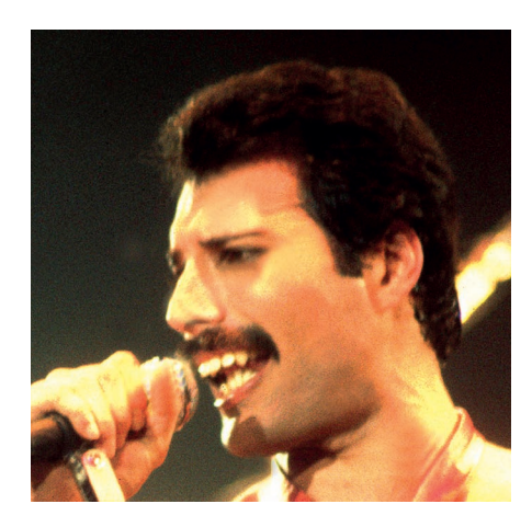
Fig. 12 Freddie Mercury.

Perhaps the most succinct and beautiful statement on the value of personal dental identity was penned by John Craig in a 2003