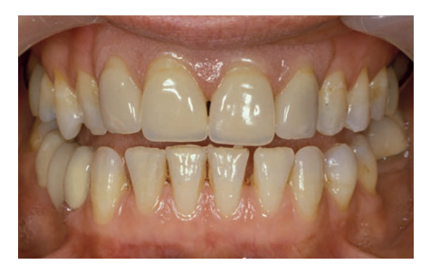
Fig. 4 The patient supervised the exact contours of her gingival margins for this rotational pathway partial denture replacing the upper incisors

Some patients will try to decline this offer of control and the responsibility that goes with it, saying: 'You're the expert, you know best, you decide.' In the authors' opinion it is extremely unwise to accept this shift of responsibility, for the reasons given above. If the patient or a member of her family later decides he/she doesn't like the appearance of the finished dentures, it will then be seen as the clinician's fault. This may give rise to disagreement, conflict, even litigation. At the very least it will sour the working relationship, cause disappointment, loss of job satisfaction, and bring stress rather than joy to the practice.