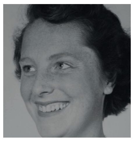
Fig. 8 The patient pictured in Fig. 7, with her natural dentition

and lots of time. Not everyone working in the prosthodontic field, clinician or technician, has either the skill or the patience to achieve this, and not every patient can afford it. In the absence of any remaining natural teeth, it is much easier to provide stereotypical denture tooth arrangements with teeth of a standard shade and unvarying mould, working from a preconceived image already stored in the head, than to work from a photograph of a patient's actual dentition and try to match that. What most complete denture wearers get instead and some are told these are the best available are the standard 'nobody in particular' set-ups of generalised teeth (sometimes called the BSD or British Standard Denture, though it is by no means limited to these islands) (Fig. 7). Monochrome flat pink gumwork is usually also