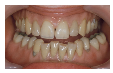
Fig. 6 Complete dentures fully characterised

At the other extreme, and much less common, is an aesthetic vision which embraces as many visual imperfections as can be crammed into a dental array, in the possibly exaggerated celebration of natural variation plus wear and tear (Fig. 6). Those who aim for this extreme,